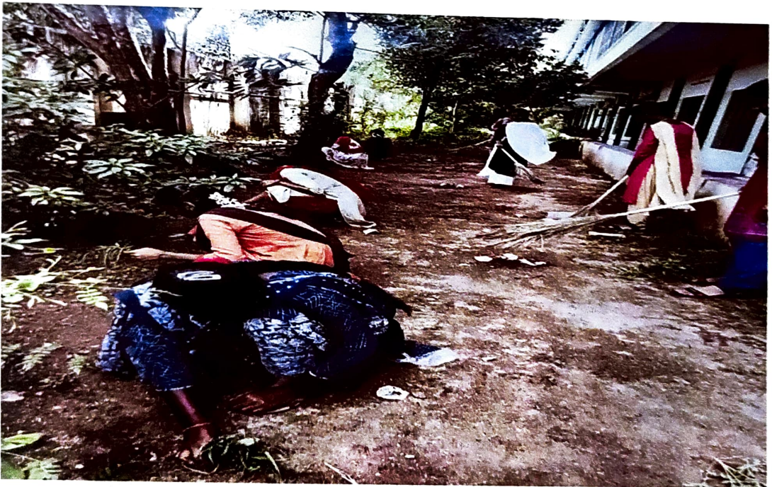
Swaach Bharath Camp

The campus of D.K.M College for Women was pretty much dirty with leaves shed and plastic thrown here and there. Youth Red Cross club organized the programme Swaach D.K.M College. The motto of this activity was to Clean and organize the campus. Around 25 volunteers took part in the campus cleaning and they also gave awareness speech about cleanness among the students. Students were actively participated in such an awareness driven campaign and felt that they somehow contributed to the society.