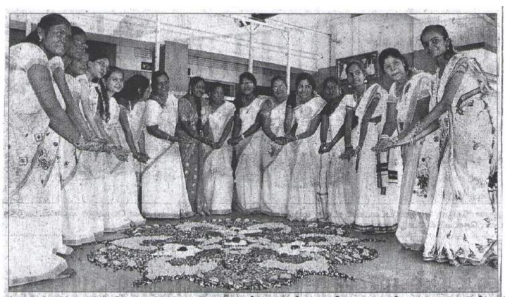
▶ ஓணம் பண்டிகையையொட்டி வேலூர் டிகேஎம் மகளிர் கல்லூரி மாணவிகள் பாரம்பரிய உடைகள் அணிந்து அத்தப்பூ கோலமிட்டு விளக்கேற்றி உற்சாகத்துடன் கொண்டாடினர்.