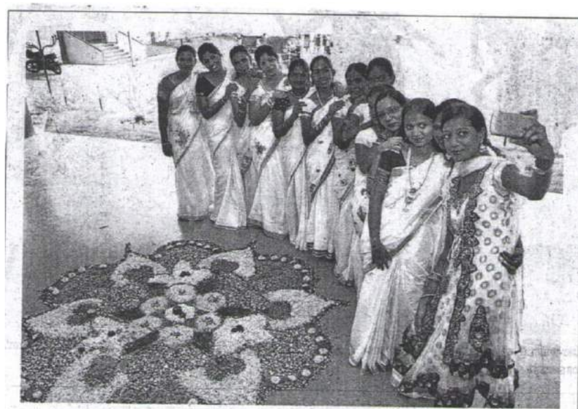
▲ வேலூர் டிகேஎம் மகளிர் கல்லூரியில் ஓணம் பண்டிகைக்காக அலங்கரிக்கப்பட்ட அத்தப்பூ கோலத்தின் முன்பு மாணவிகள் செல்பீ' எடுத்துக் கொள்கின்றனர்.