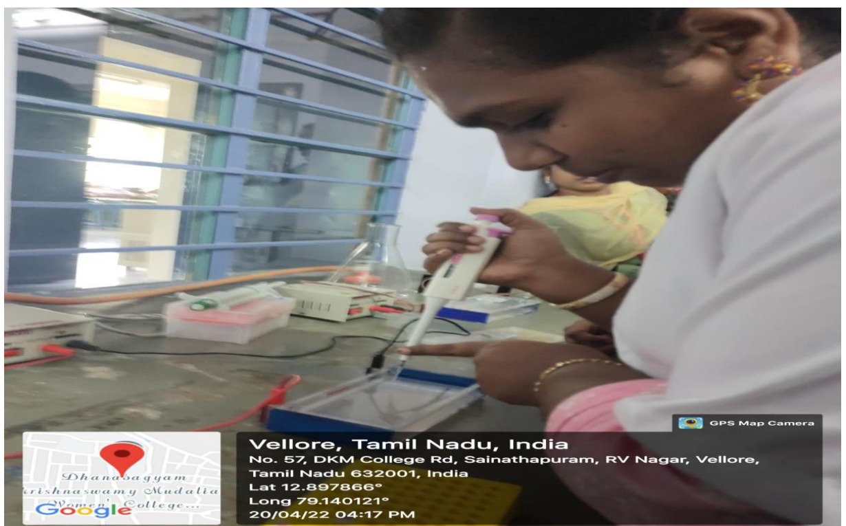
Students were loading samples into the agarose gel electrophoresis.