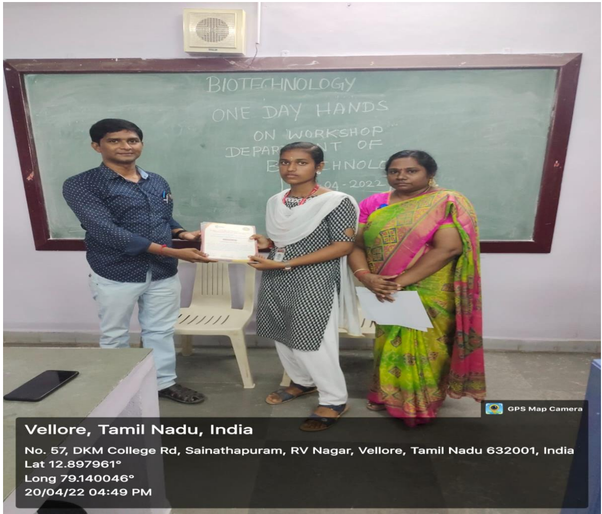
Certificates distributed by our resource person to the students.