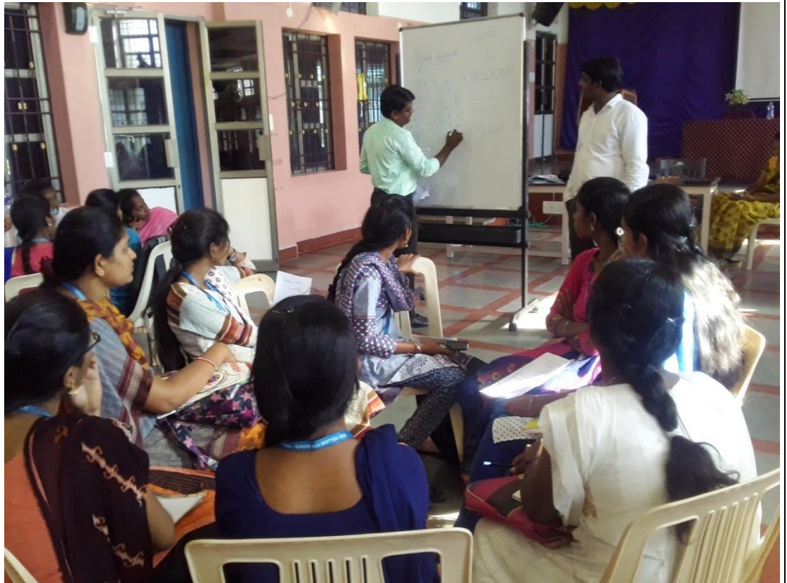
Scoring for other psychometric test were explained