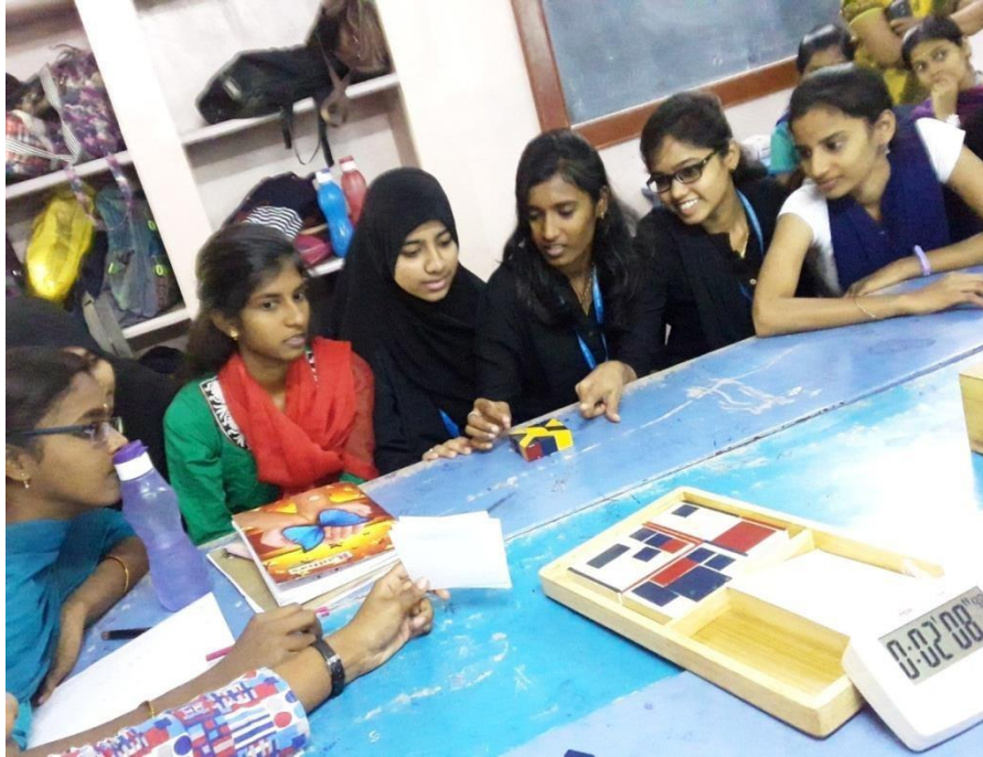
Bhatia's Intelligence test and scoring was taught as an activity