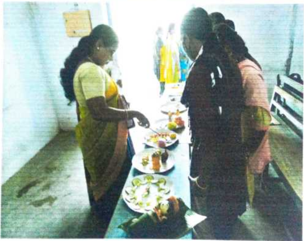
ASSIGNING MARKS BY PROFESSOR FOR FRUIT AND VEGETABLE CARVING COMPETITION.