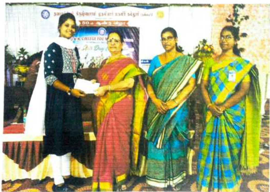
CERTIFICATE DISTRIBUTION BY THE PRINCIPAL