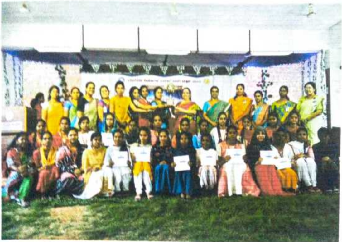
CELEBRATING SUCCESS BY WINNING TROPHY