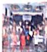
Students in a classroom setting.