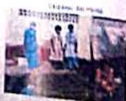
Students in a handicrafts and jewellery workshop.