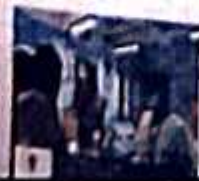
Students in a handicrafts and jewellery workshop.