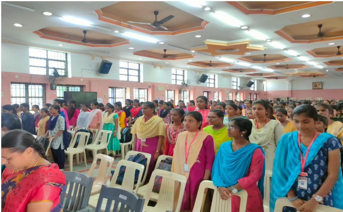
Participants of the International seminar on 03.12.2022