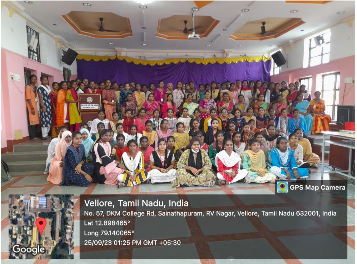
The group photo session taken with the resource persons at the end of MHRD IIC motivational programme on Impossible to I'm Possible conducted by the Department of Psychology and Department of Tamil on 25.09.2023.