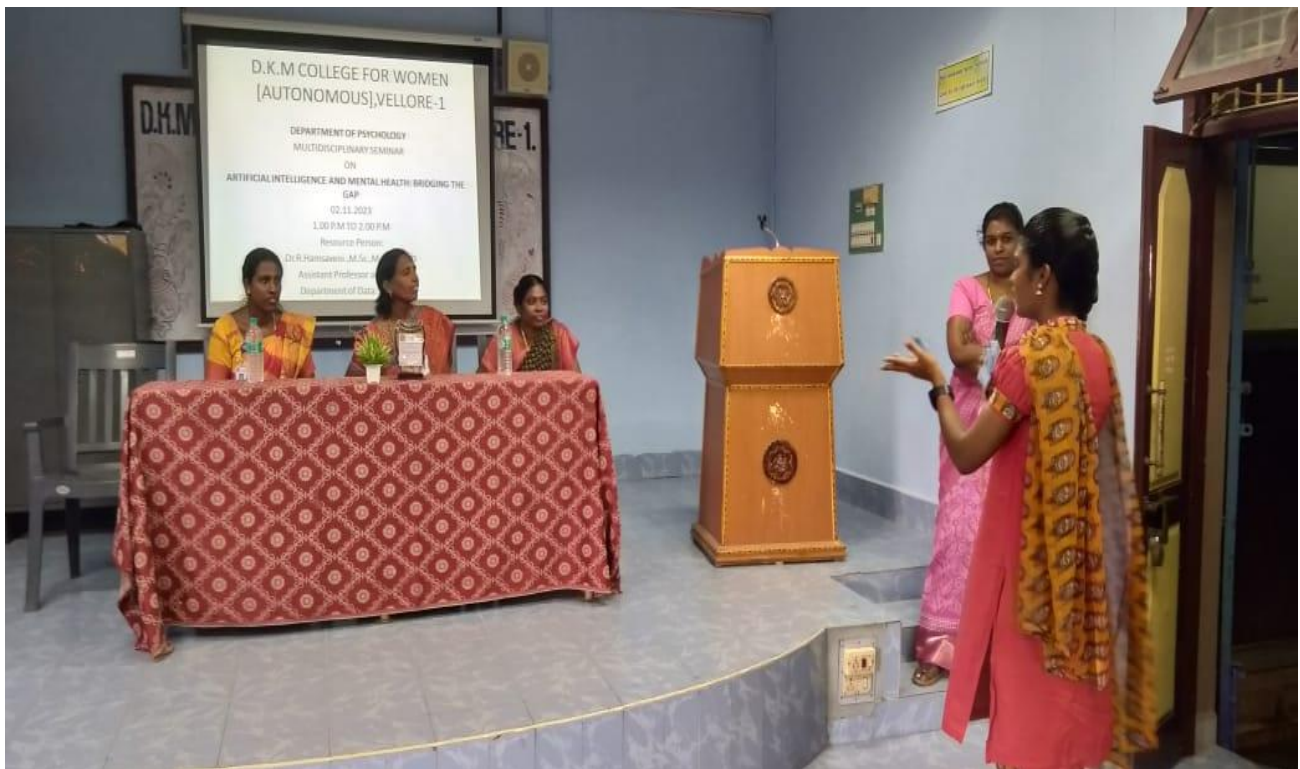
The speaker and organisers are listening to the far and against session on the topic “whether AI can replace humans in providing therapies” during multidisciplinary seminar on 02.11.2023.