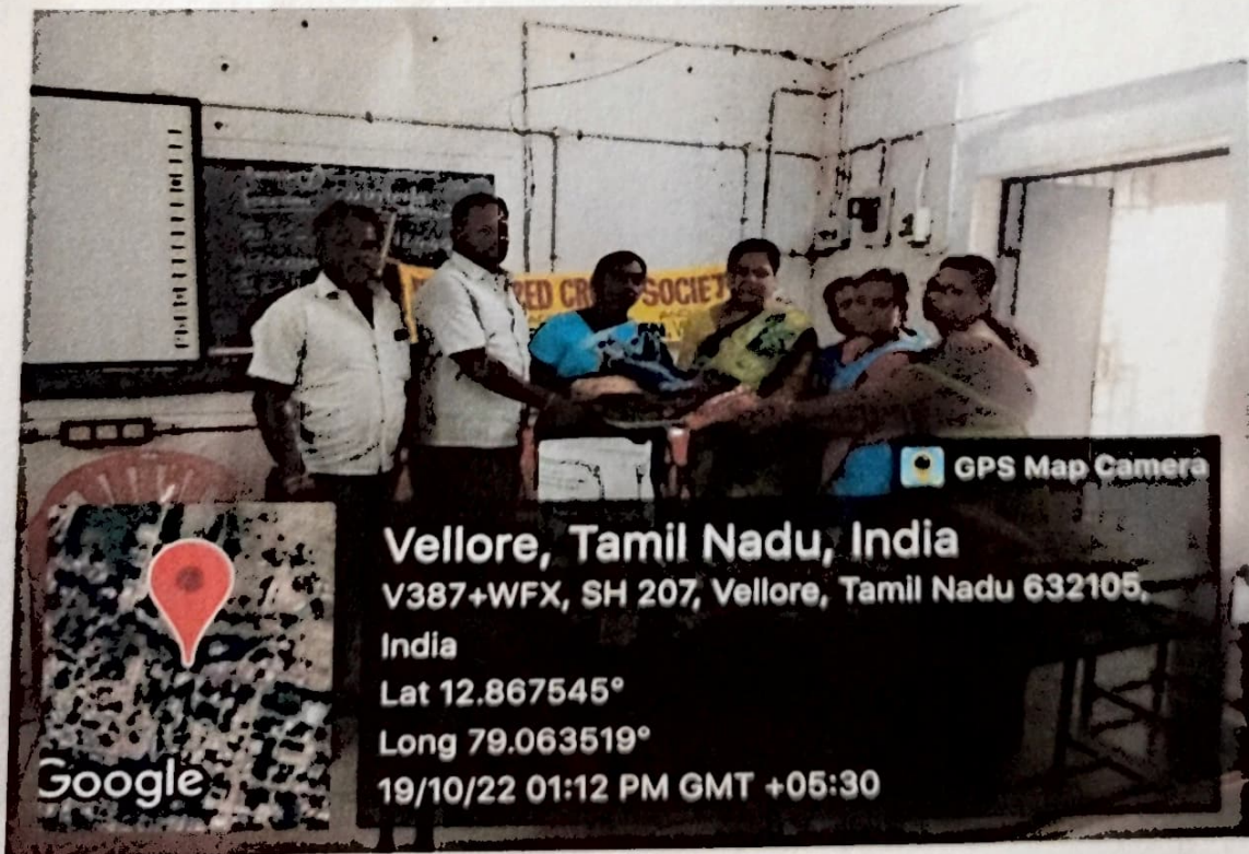
THE COLLECTED ITEMS WERE HANDED OVER TO THE PRESIDENT OF THE VILLAGE BY THE COMMITTEE MEMBERS OF YRC