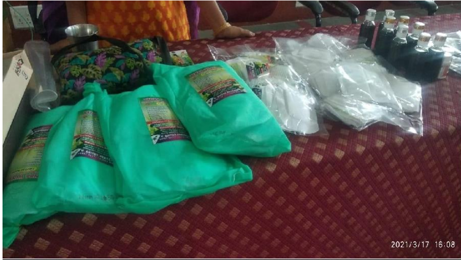
Value Added Products