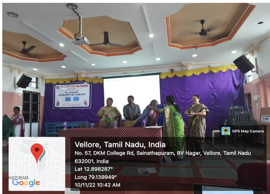
Participants in Guest lecture on “Computational Chemistry: past, Present and Furture” on 10.11.2022

Vellore, Tamil Nadu, India No. 57, DKM College Rd, Sainathapuram, RV Nagar, Vellore, Tamil Nadu 632001, India Lat 12.898287° Long 79.139949° 10/11/22 10:42 AM