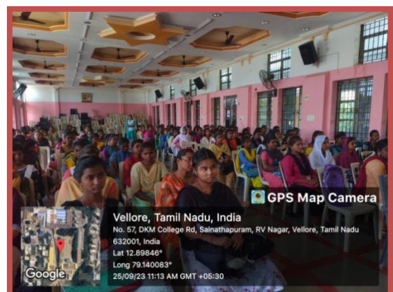
Students Listening to the Webinar