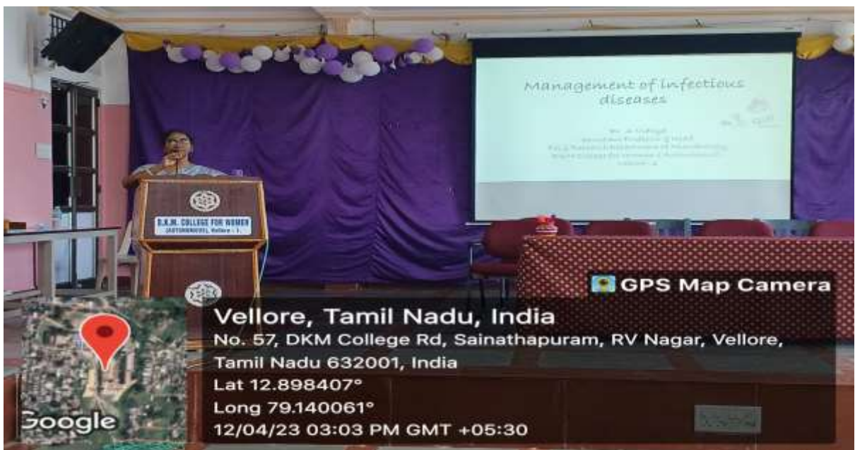
Resource person addressing the gathering