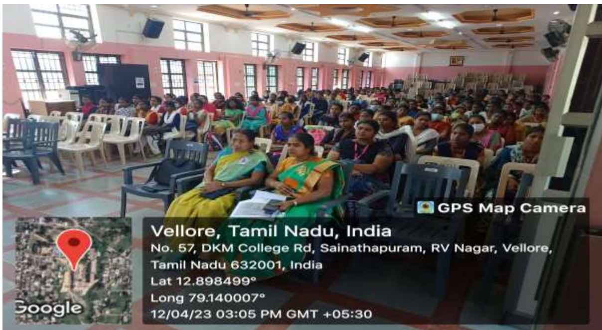
Students' participation during the session