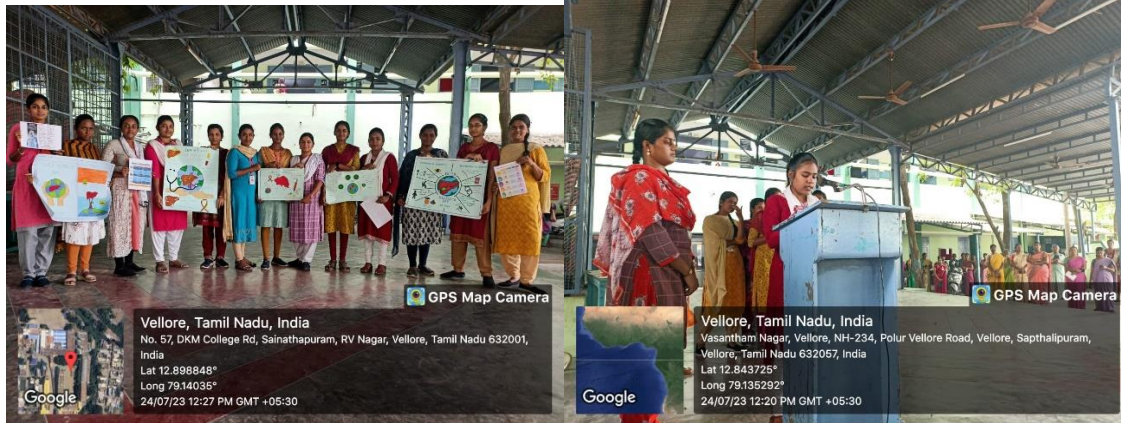
Students displayed Posters in the assembly Awareness talk by the Student in the assembly