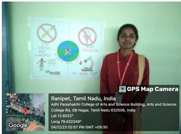
Poster presented by the student