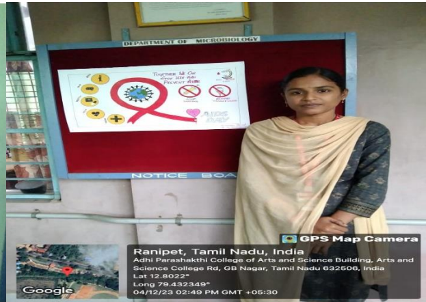
Poster presented by the student