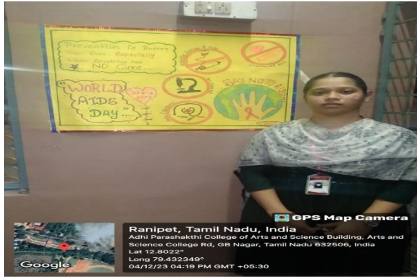
Poster presented by the student