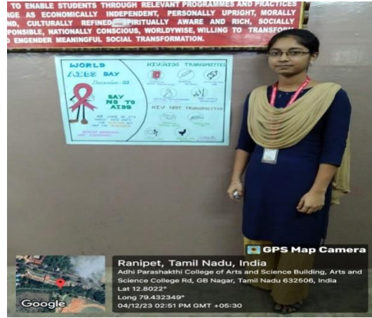
Poster presented by the student