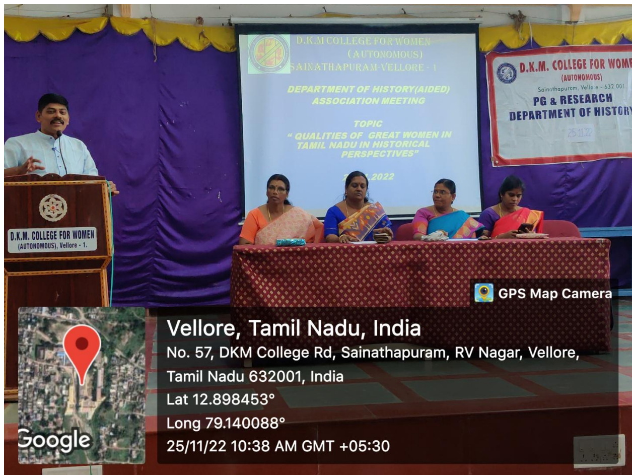
Chief Guest Delivering Address