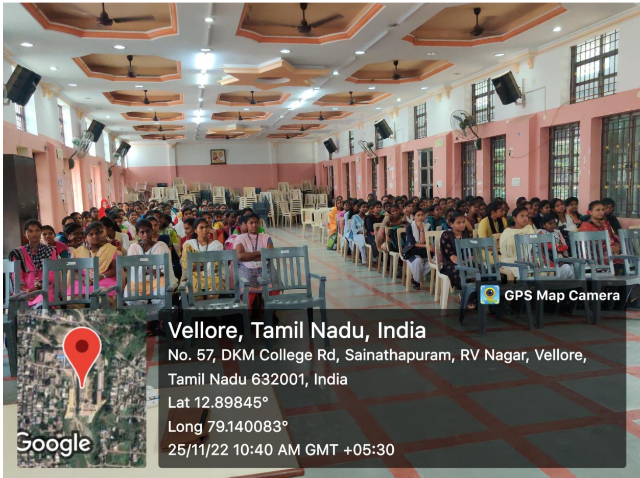
History Department Students Attending the Meeting