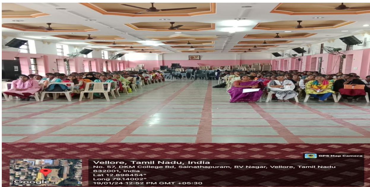
Students listening to the Guest Lecture Programme