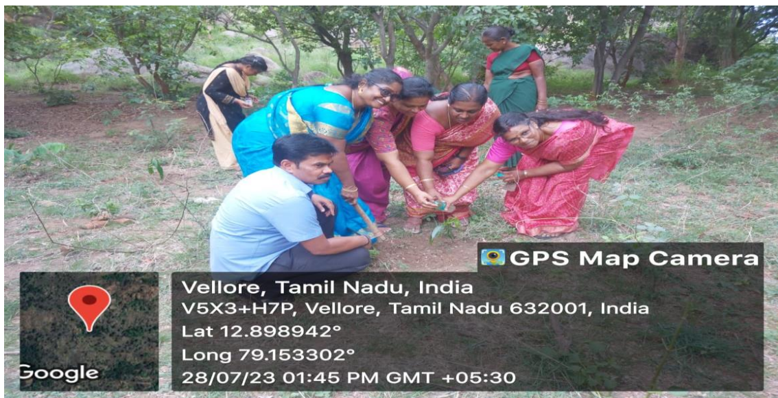
Planting sapling in the Bhagavathi hills