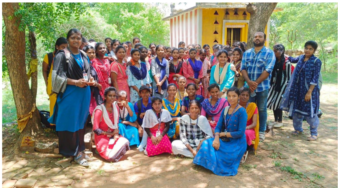
Students are in the Baghavathi hills