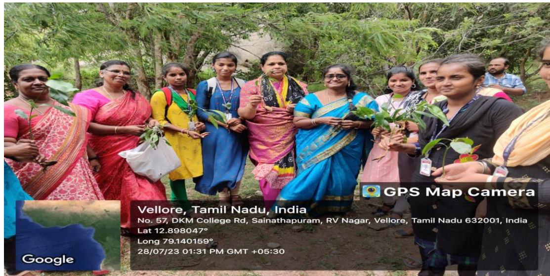
Staff and students are ready with saplings to plant in the Bagavathi hill