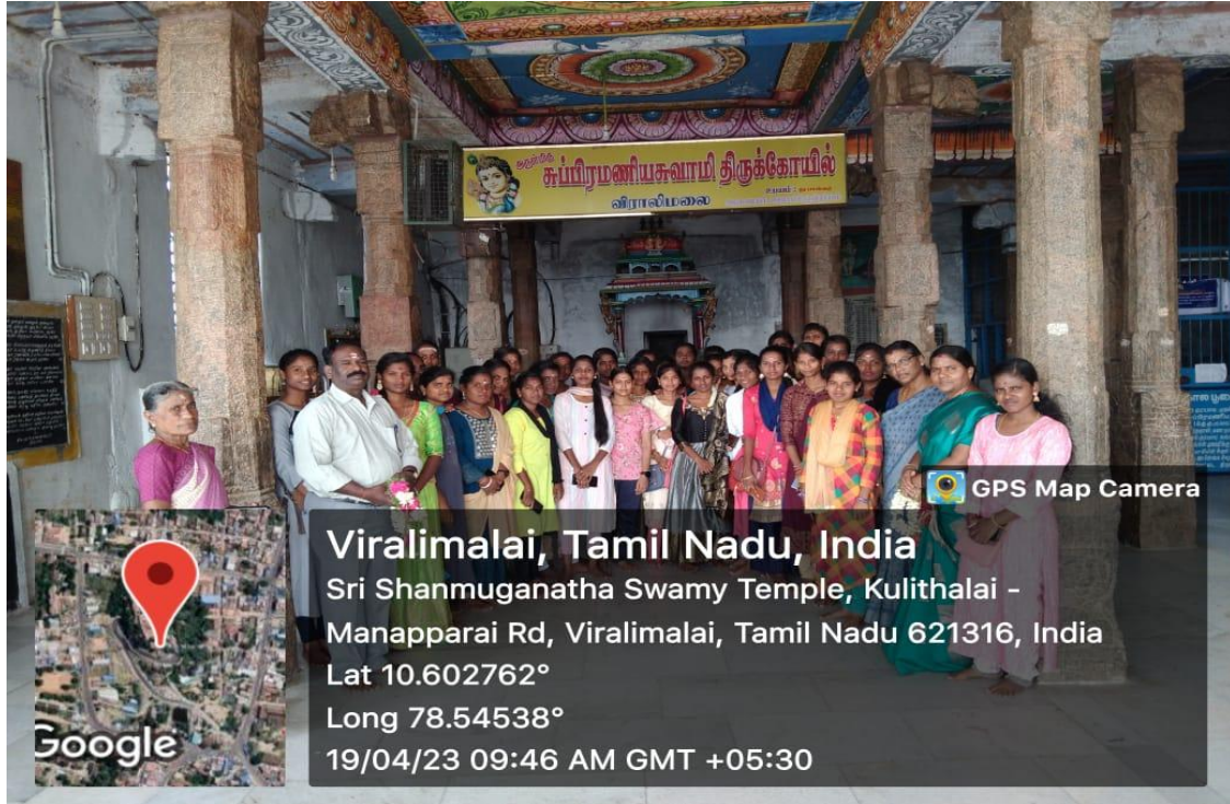
Viralimalai Murugan Temple located in Viralimalai in trichy