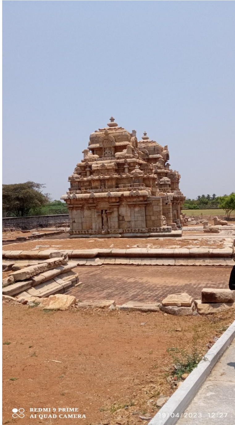
Moovar Temple in the village of Kodumbalur, Puthukottai district