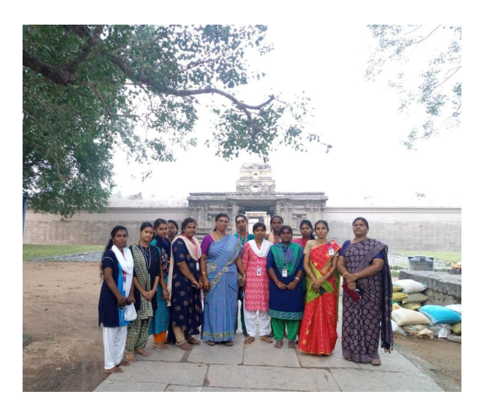
Somanatheeswarar Temple in Melpadi