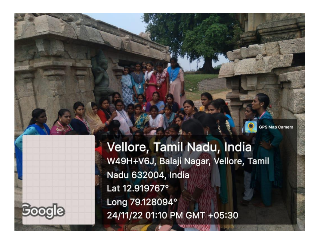
Students at Errukammpet Temple