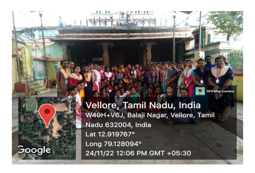
Thiruvalam Vilvanatheeswarar Temple