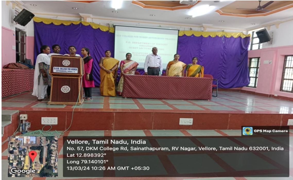
Inauguration of Guest Lecture Programme with Tamilzthai vazhthu