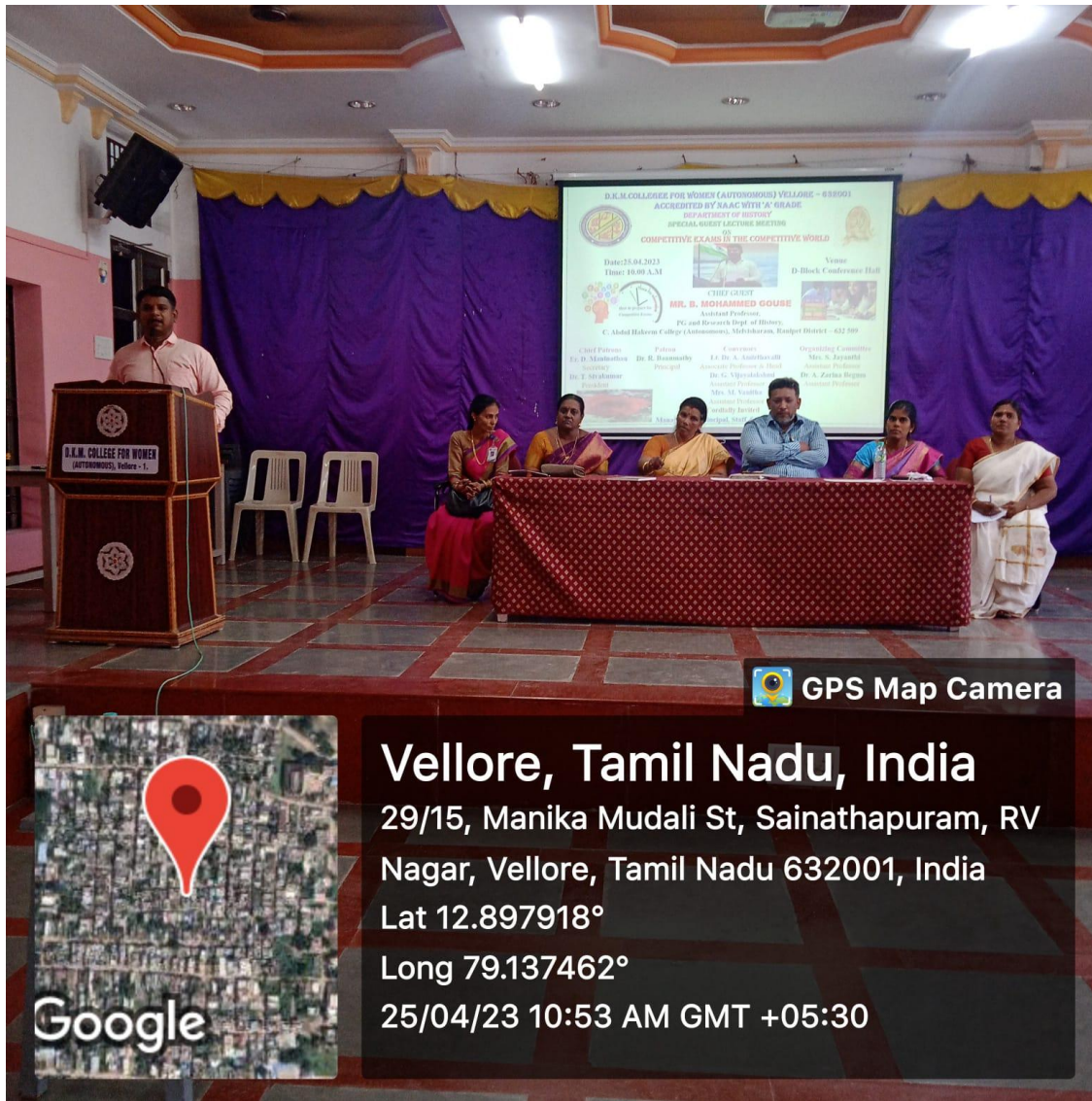
Chief Guest delivering lecture